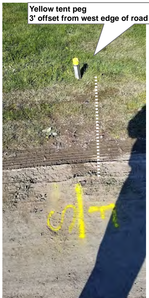
Yellow Tent Peg marker